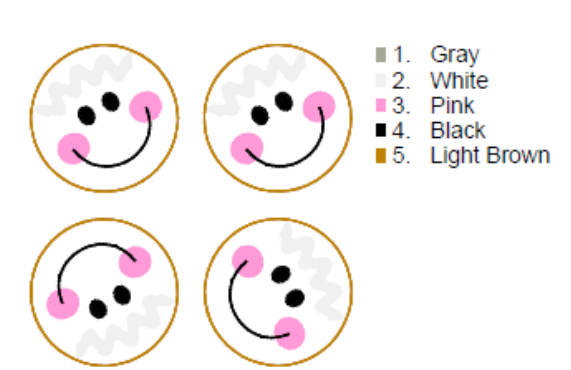
Gingerface 45mm Sorted.pes 98.30x98.40 mm; 5,845 stitches 5 thread changes; 5 colors